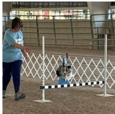
Turner's Rally Novice Title