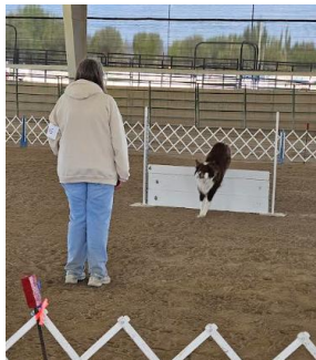
Penny & Angel