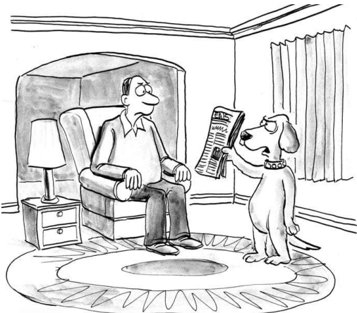
"I'll only give you the paper if you promise not to let the news upset you."

SIGN-UP FOR OCTOBER CLASSES 10/1/2024 AND 10/2/2024. Please call 385-256-4097, for class Information.