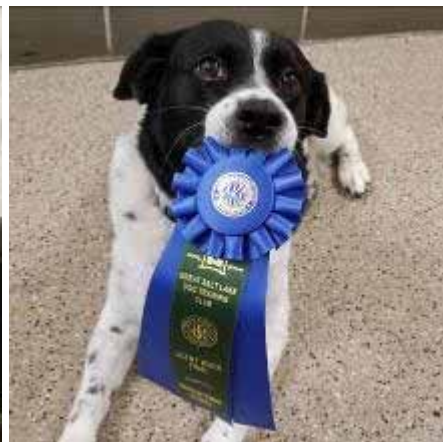
Luna with her Ribbon