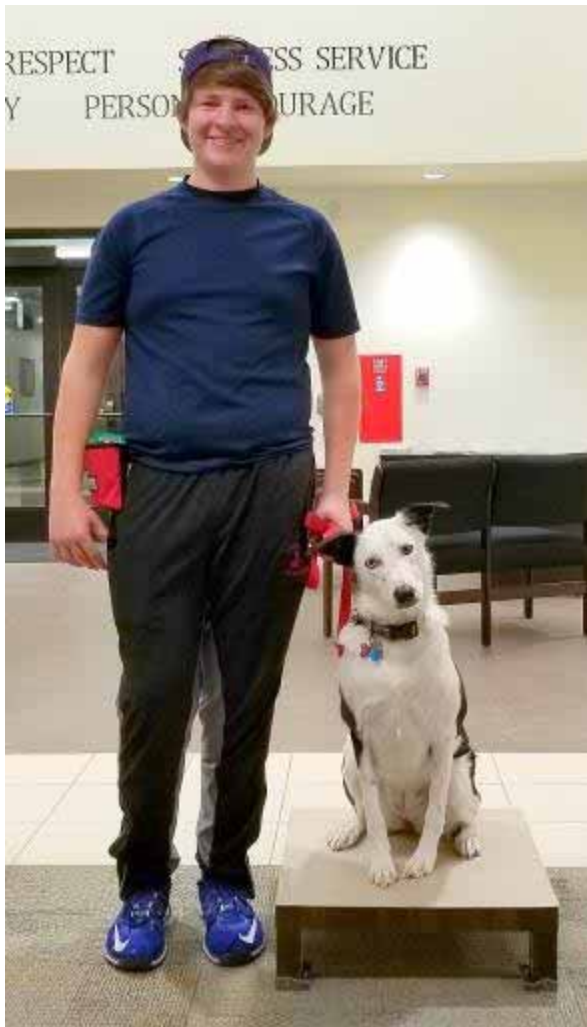
Newest Trick Dog Intermediate title holder