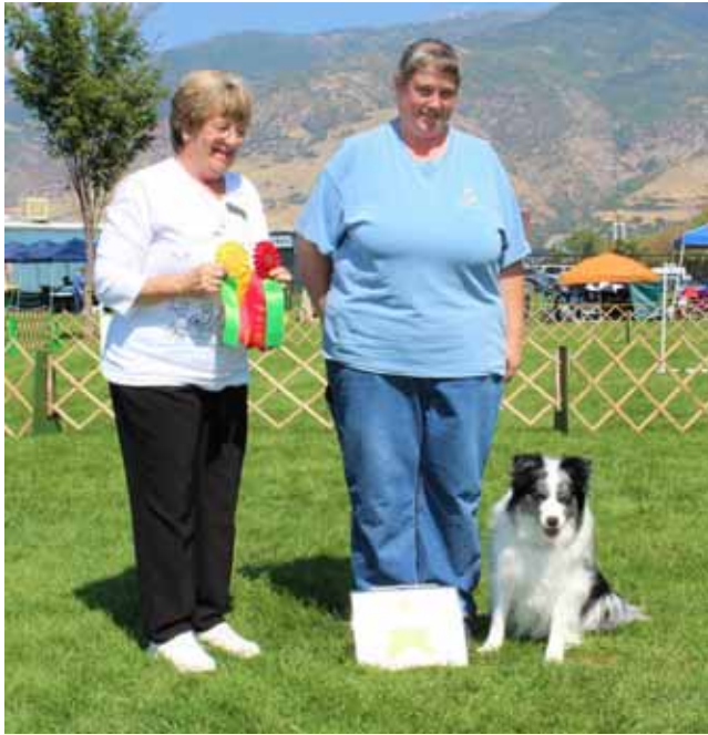
From April Bruce: Toots did it!!! New RAE title!!