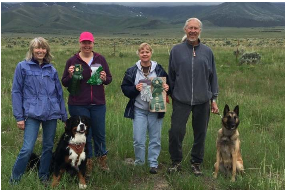
New TD;s Harrier's and Sussex