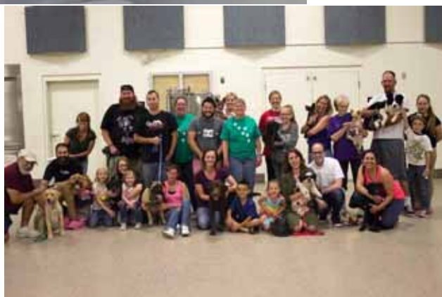
May 2017 New STAR Puppy Graduates