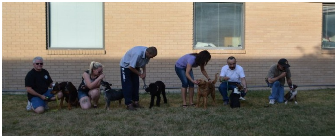
STAR Puppy Graduates

Say hello to the NEWEST STAR Puppy and CGC Graduates! HUGE Congratulations to one and all!