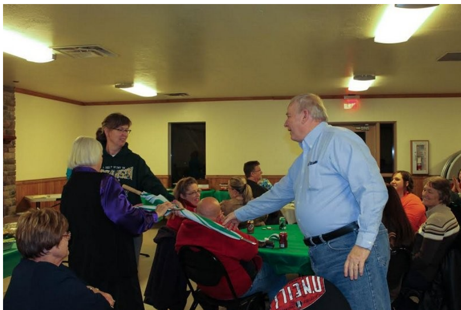
A few more Awards