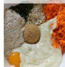
Banana Carrot Dog Treats

Store in airtight container in refrigerator for a week or freeze for up to 3 months.