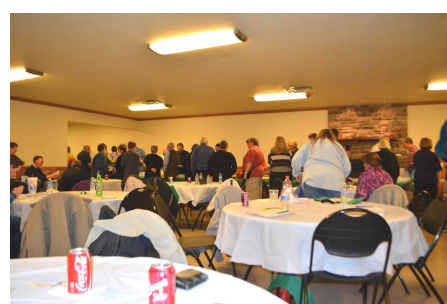
Dinner time!! LOTS of YUMMY food