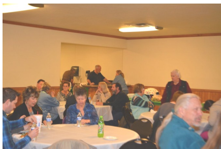
Some of our attendees