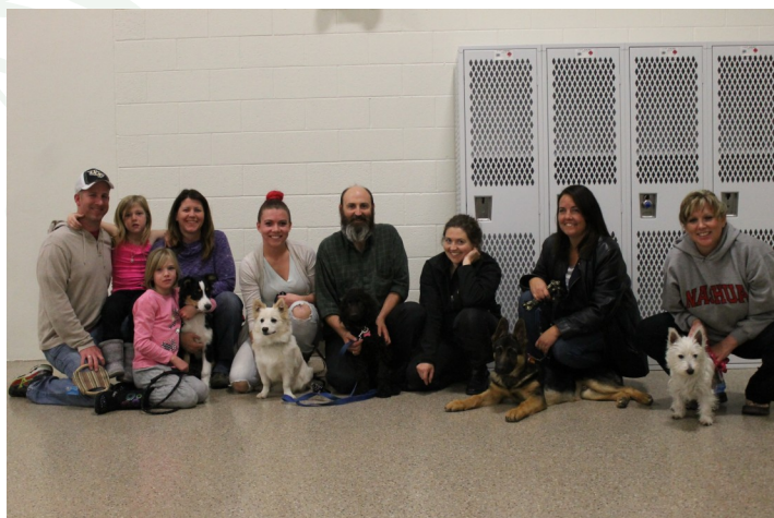
STAR Puppy Class